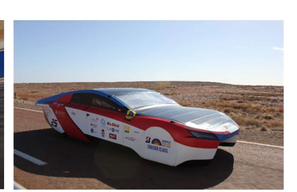
Figure 4 - SOPHIE 6s in Cruiser Class of WSC 2019

From the preparation and construction of the solar car to the race in WSC, the student participants face different challenges, such as interdisciplinary knowledge, hands-on science and engineering skills, self-directed learning and innovative thinking. This helps develop students' collaboration, management and innovation abilities and prepares them for unknown future careers and increasingly complex professional environments. With the rapid growth of the students in the engineering culture through their participation, the project always starts as a challenge for students and ends as a task for scientists and engineers better prepared by their nature.